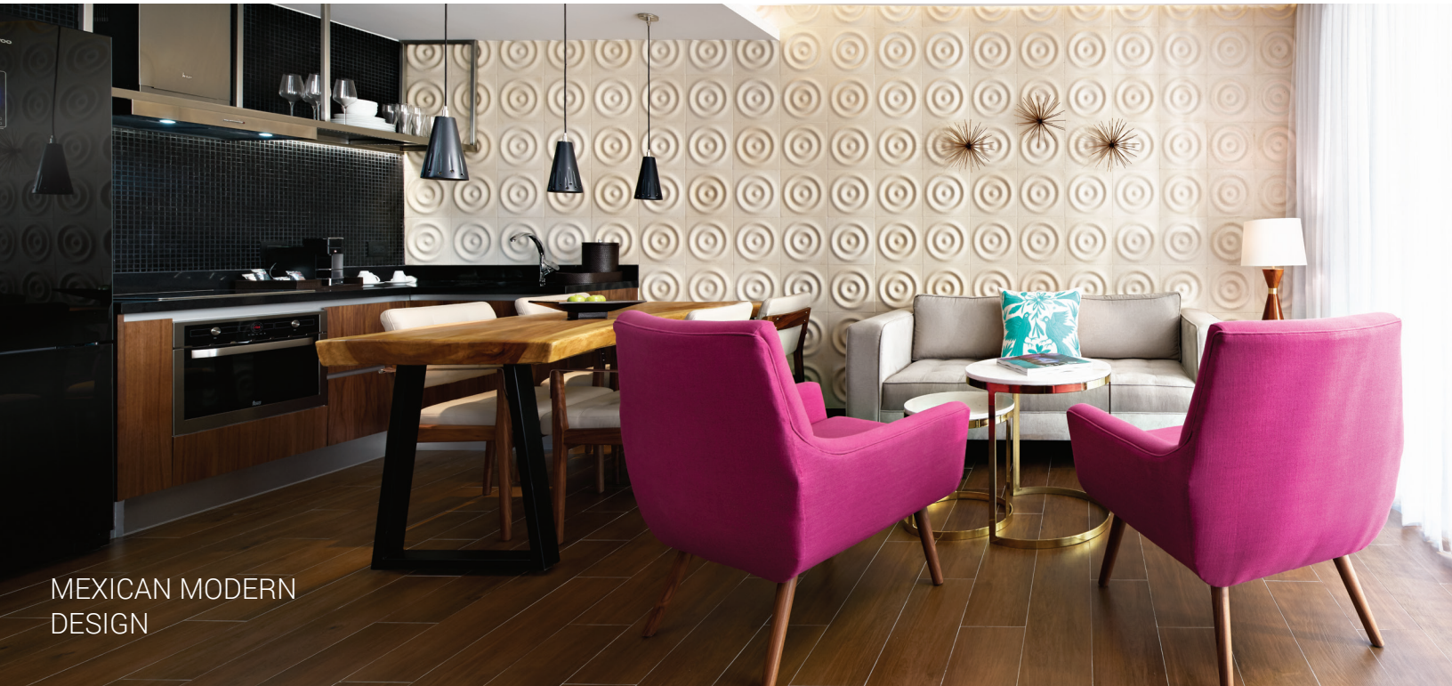
MEXICAN MODERN DESIGN

DOWNTOWN HOTEL & RESIDENCES PLAYA DEL CARMEN