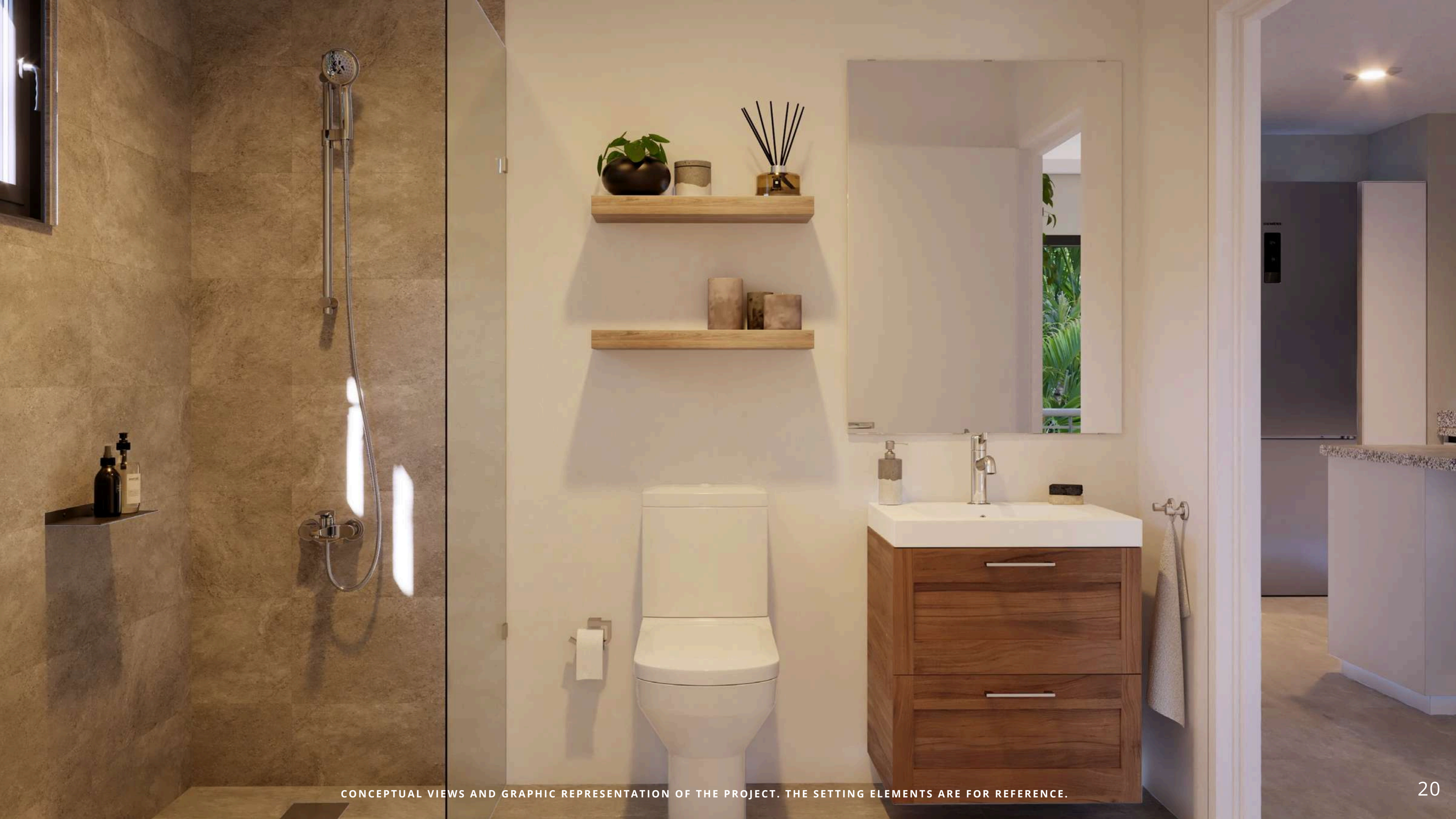
CONCEPTUAL VIEWS AND GRAPHIC REPRESENTATION OF THE PROJECT. THE SETTING ELEMENTS ARE FOR REFERENCE.