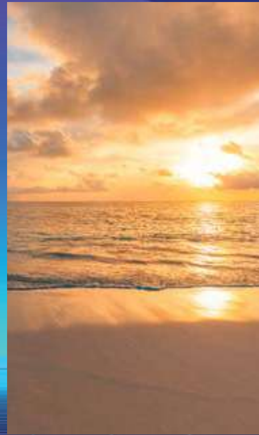
BEACH 4 MINUTES AWAY