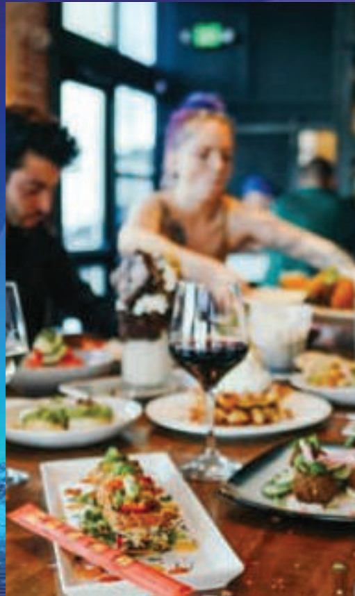
MALLS AND RESTAURANTS 2 MINUTES AWAY