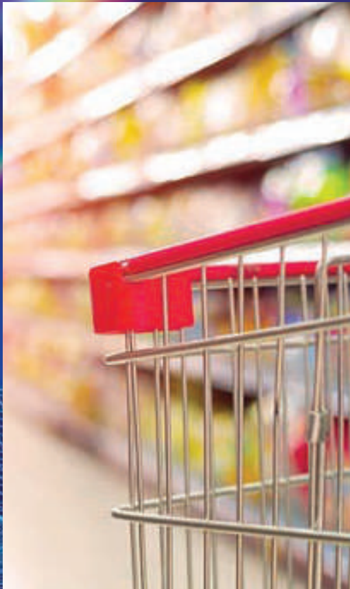
SUPERMARKET 2 MINUTES AWAY