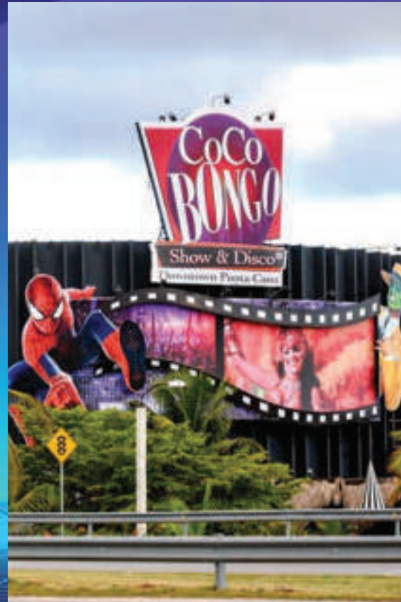
COCO BONGO LESS THAN 4 MINUTES AWAY