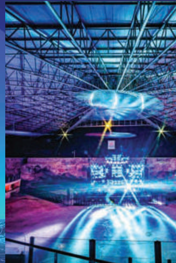
IMAGINE CAVE NIGHTCLUB 2 MINUTES AWAY