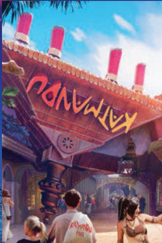
KATMANDU PARK LESS THAN 6 MINUTES AWAY