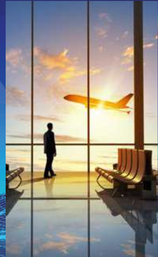
AIRPORT 8 MINUTES AWAY