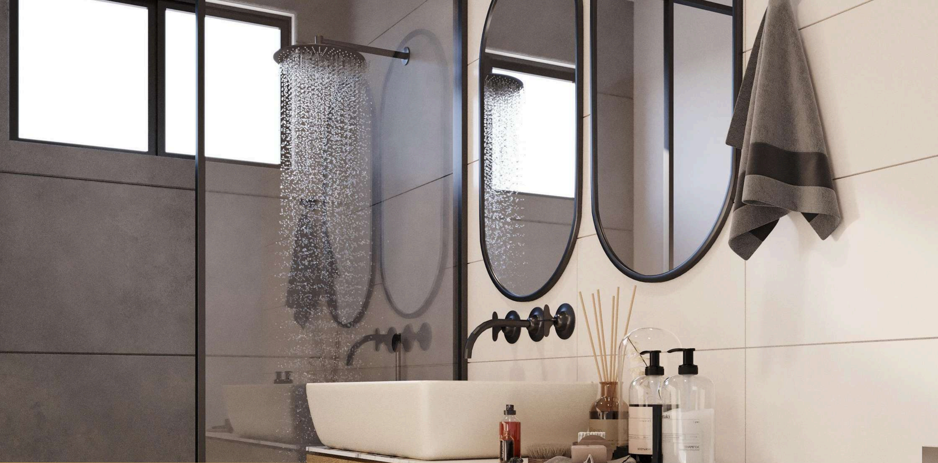
MASTER BEDROOM BATHROOM