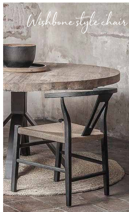
Wishbone style chair