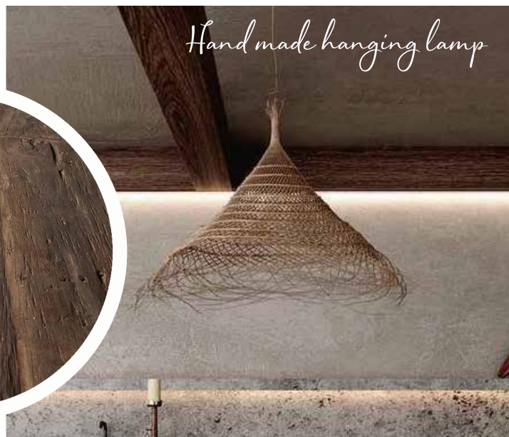
Hand made hanging lamp