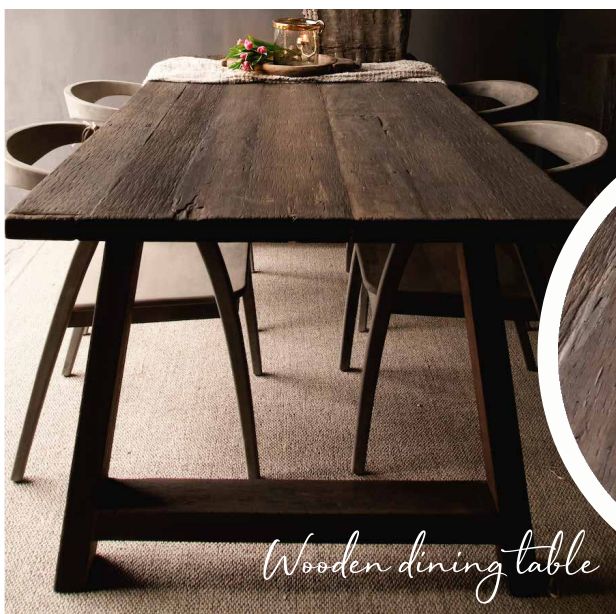
Wooden dining table