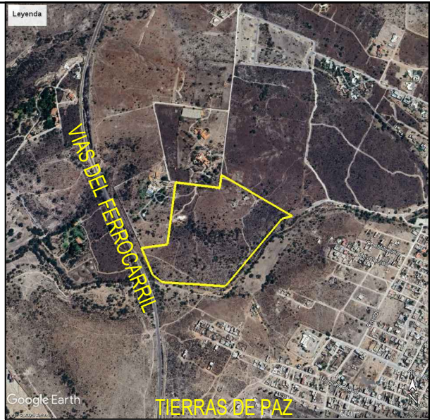
ZONA DE ESTUDIO