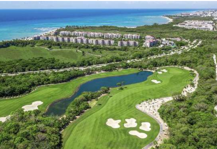
Golf Course Gran Coyote