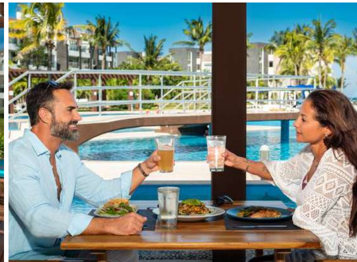
Punto Azul Gastrobar