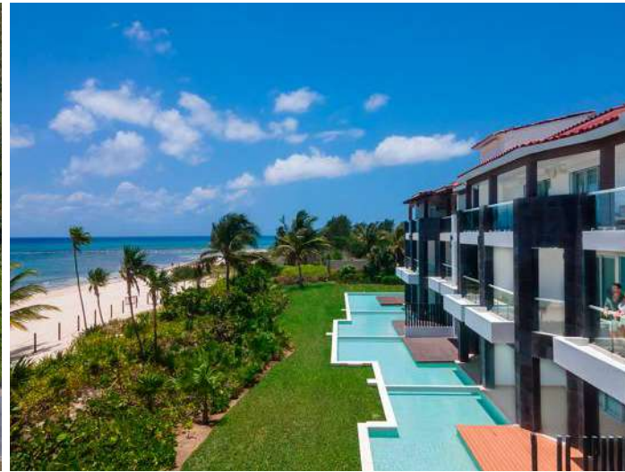
237 meters of beach with exclusive use for Mareazul owners