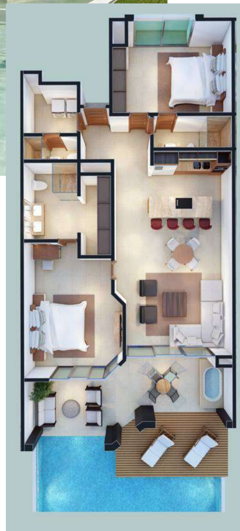
2 Bedroom Plan

Located on the ground floor, this model offers the perfect atmosphere for a lifestyle in connection with your surroundings and nature. The spacious terrace with its own private relaxation pool gives you the freedom to walk onto the beach and to create memorable experiences with your family and friends.