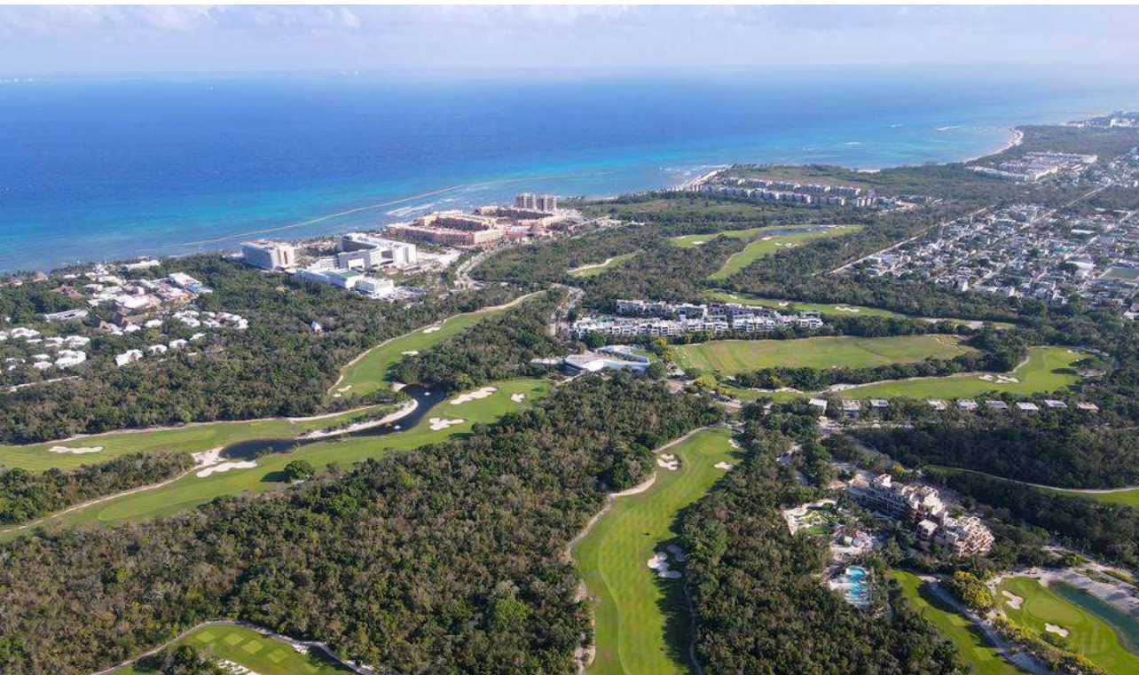
Diamond Zone, Golf Gran Coyote in Corasol