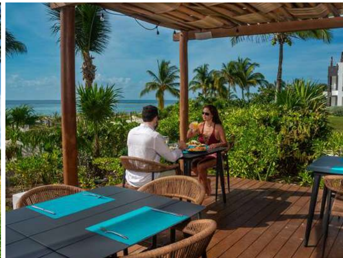
Faro Azul Grill