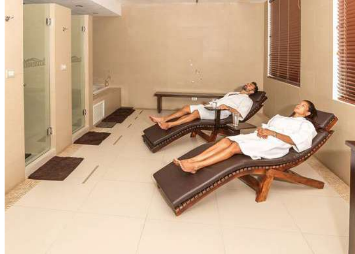
Walkways and Mayan Sculpture Park