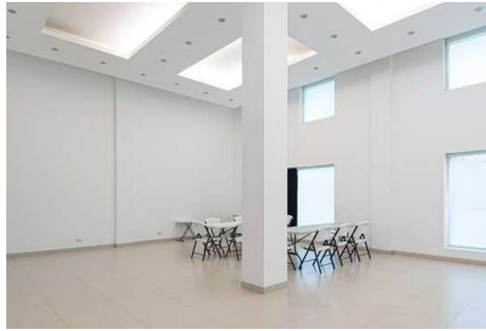
Multi Purpose Hall