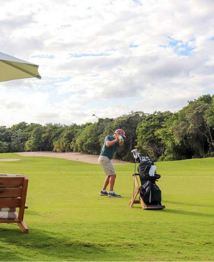
Golf Gran Coyote