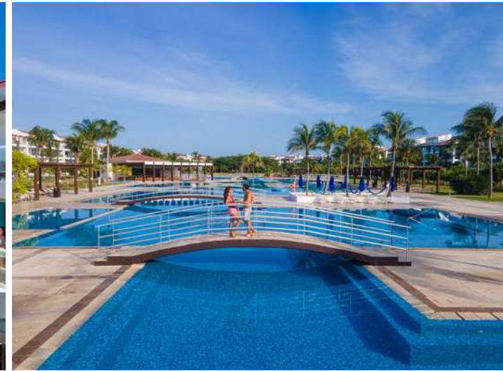
Swimming Pool with 130 m wide