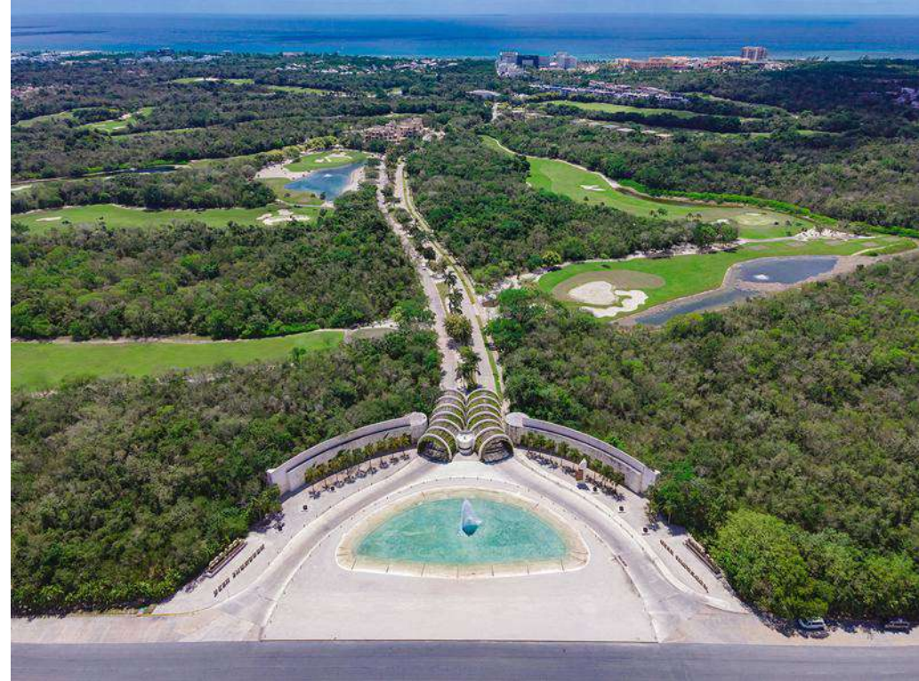
Corasol main access

At the same time, the ' Diamond Zone ' is a district with golf courses, high-end hotels and premium properties, within this area is Corasol , just 40 km away from Cancun's international Airport and 5 minutes from the centre of Playa Del Carmen where one can enjoy world class gastronomic and entertainment experiences.