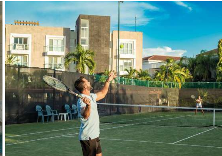
Tennis & Paddle Courts