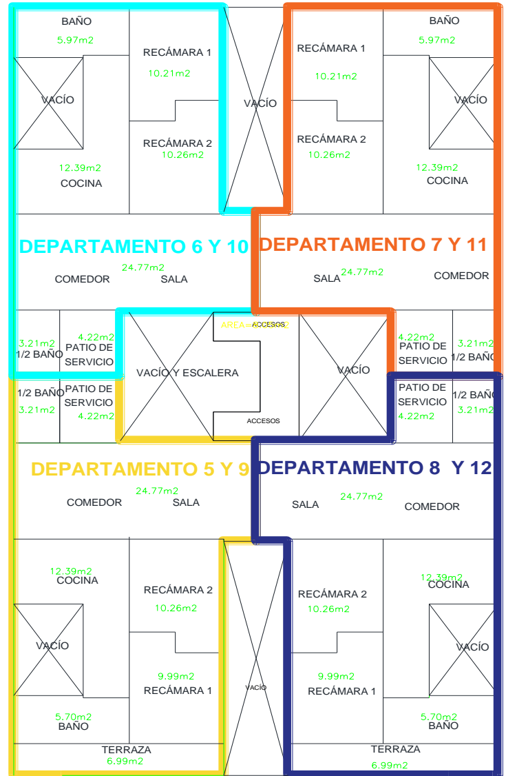
1RO. Y 2DO. NIVEL