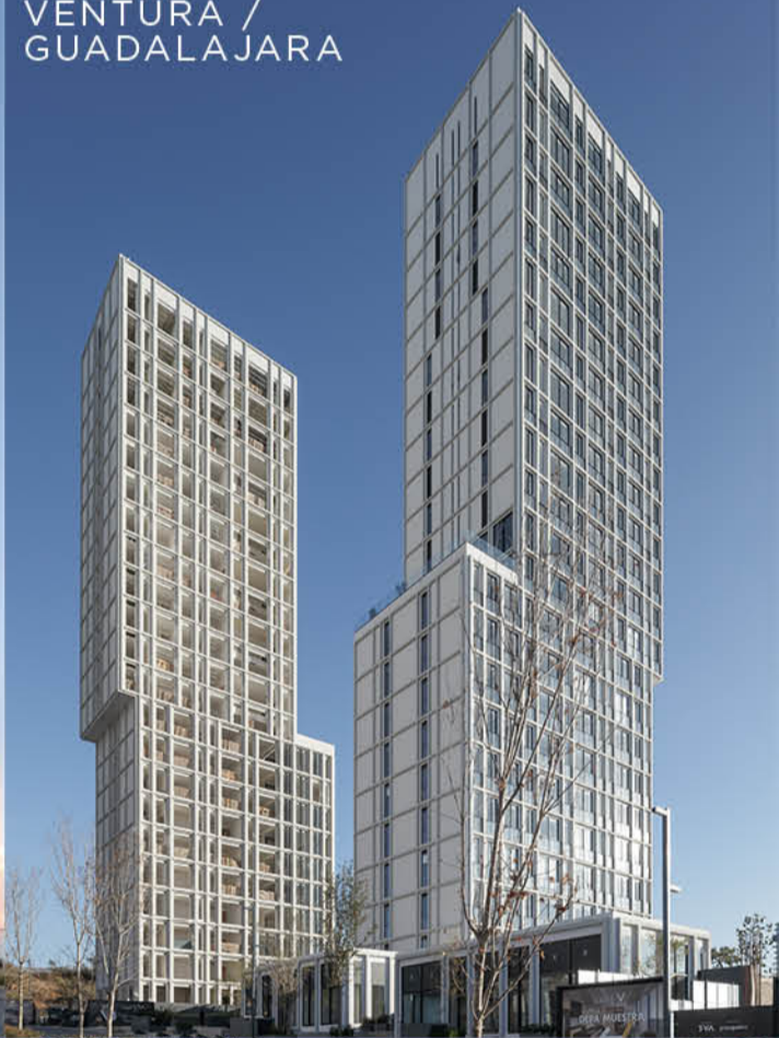
VENTURA / GUADALAJARA