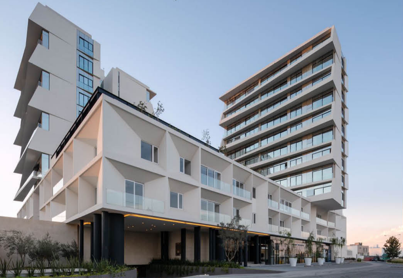
VITIA LA TOSCANA / GUADALAJARA