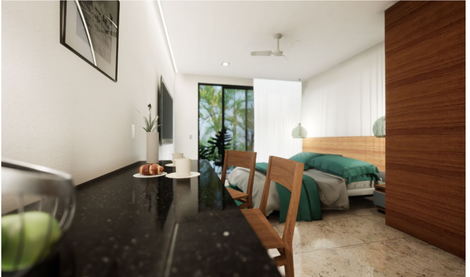
A and B studios