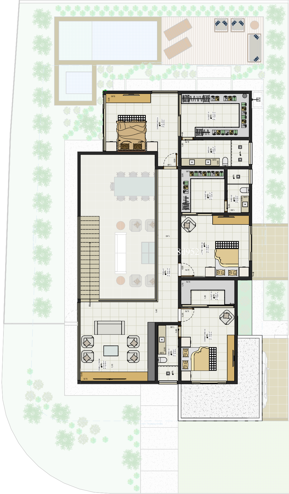
● GUAJACA 58 – PUNTA CANA VILLAGE PLANTA BAJA - PISO SUPERIOR ESC. 1 : 50