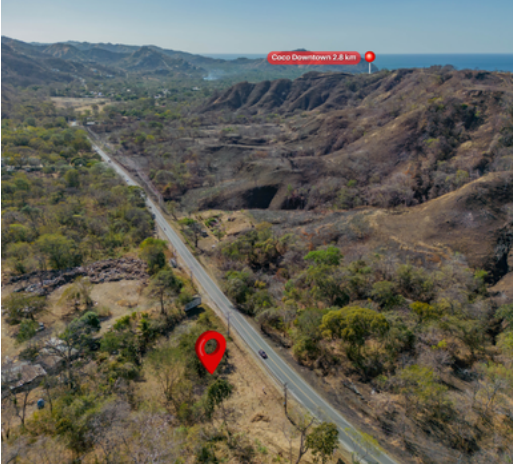
La Colina lot - Playas del Coco

Within close proximity to the Playas del Coco and Playa Hermosa intersection, La Colina lot represents an unique investment opportunity due to its privileged location in a region with strong economical growth indices.