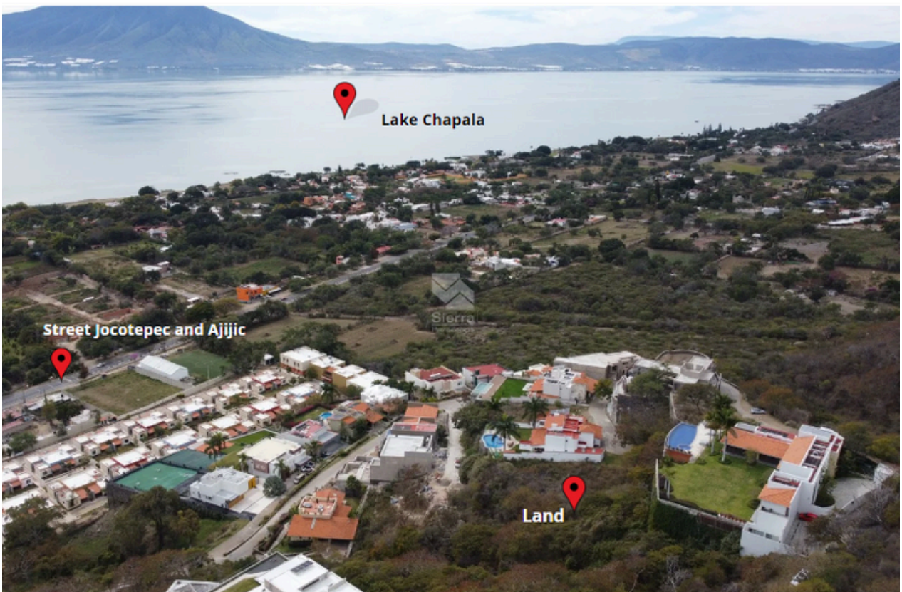
AERIAL VIEW OF LAND