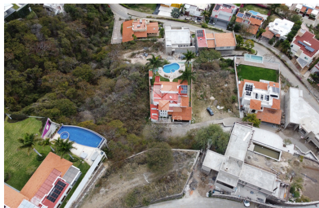
VIEW OF LAND