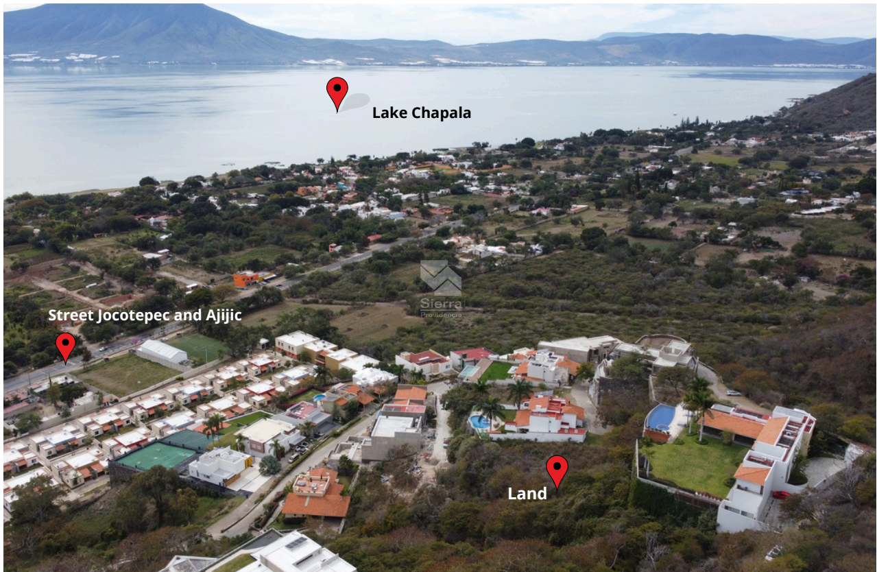
AERIAL VIEW OF LAND