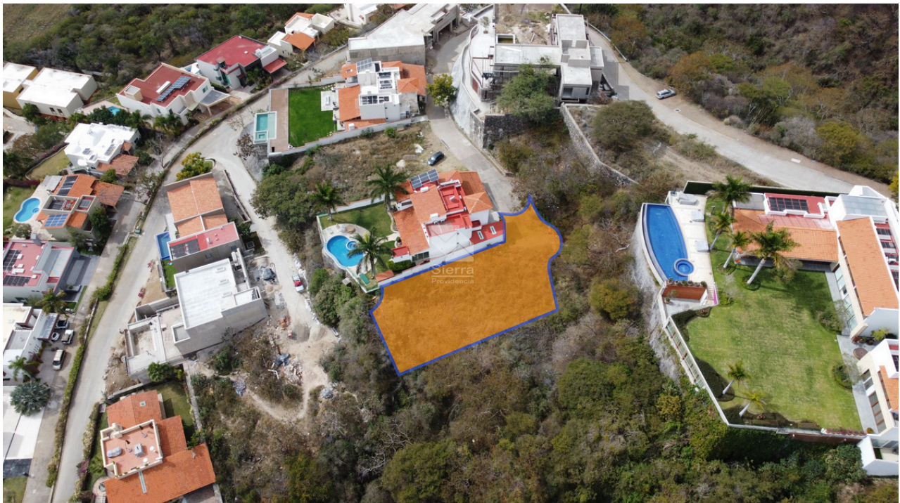
AERIAL VIEW OF LAND