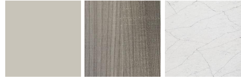
WATER REPELLENT FINISHES