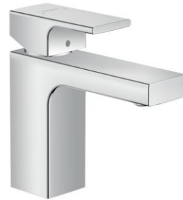
Water Efficient Mixers