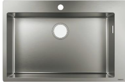
STAINLESS-STEEL BUILT-IN SINK