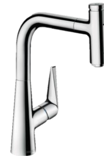
PULL OUT SPRAY KITCHEN MIXER