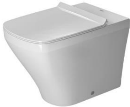
Floor Standing Toilets