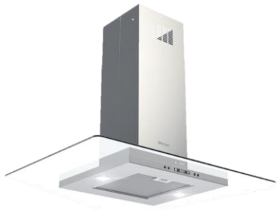
TOUCH CONTROL EXTRACTION HOOD