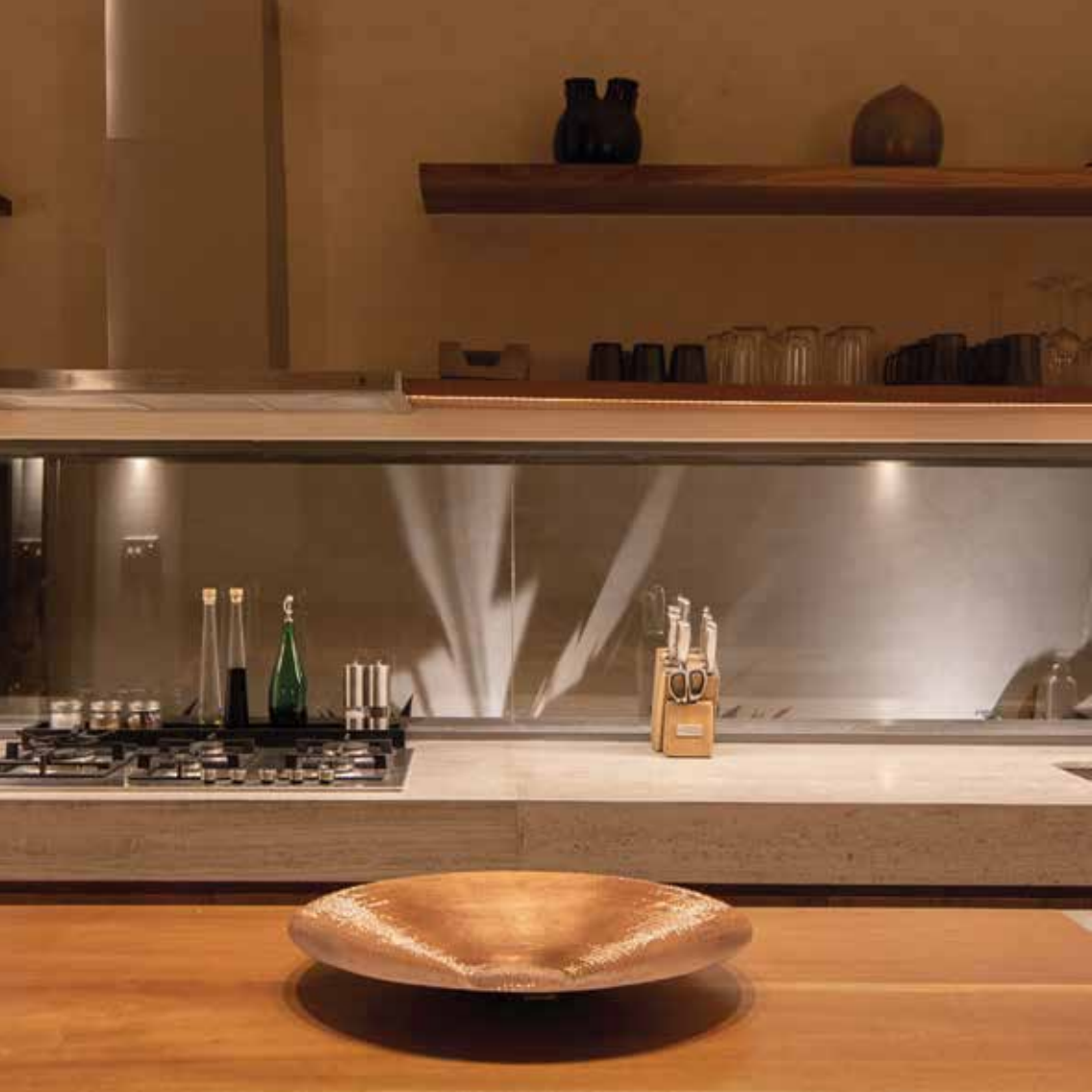
Designs and materials that enhance the architecture of the peninsula, creating unique spaces.