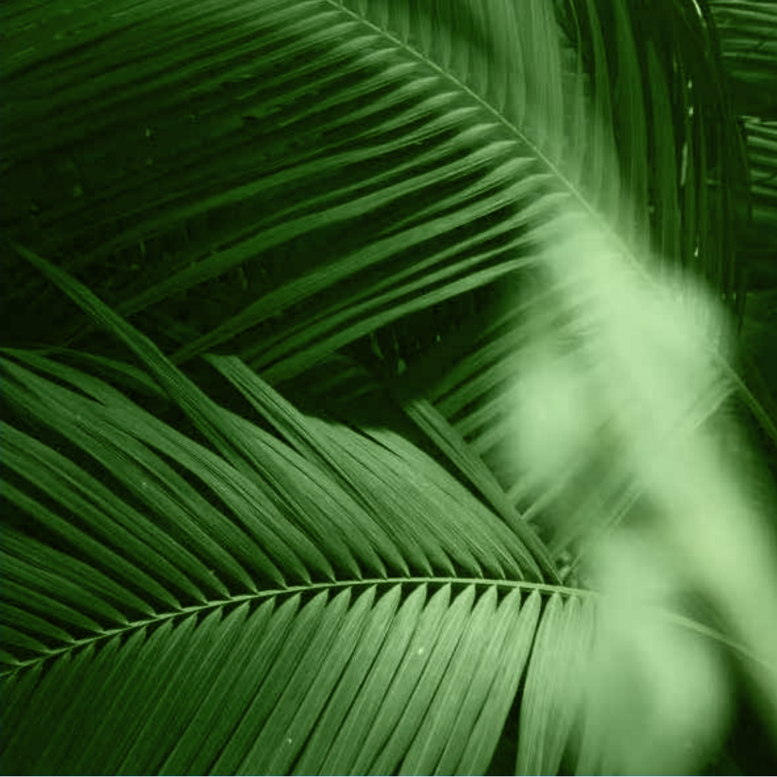
Private spaces that converge with patios and landscaped areas.