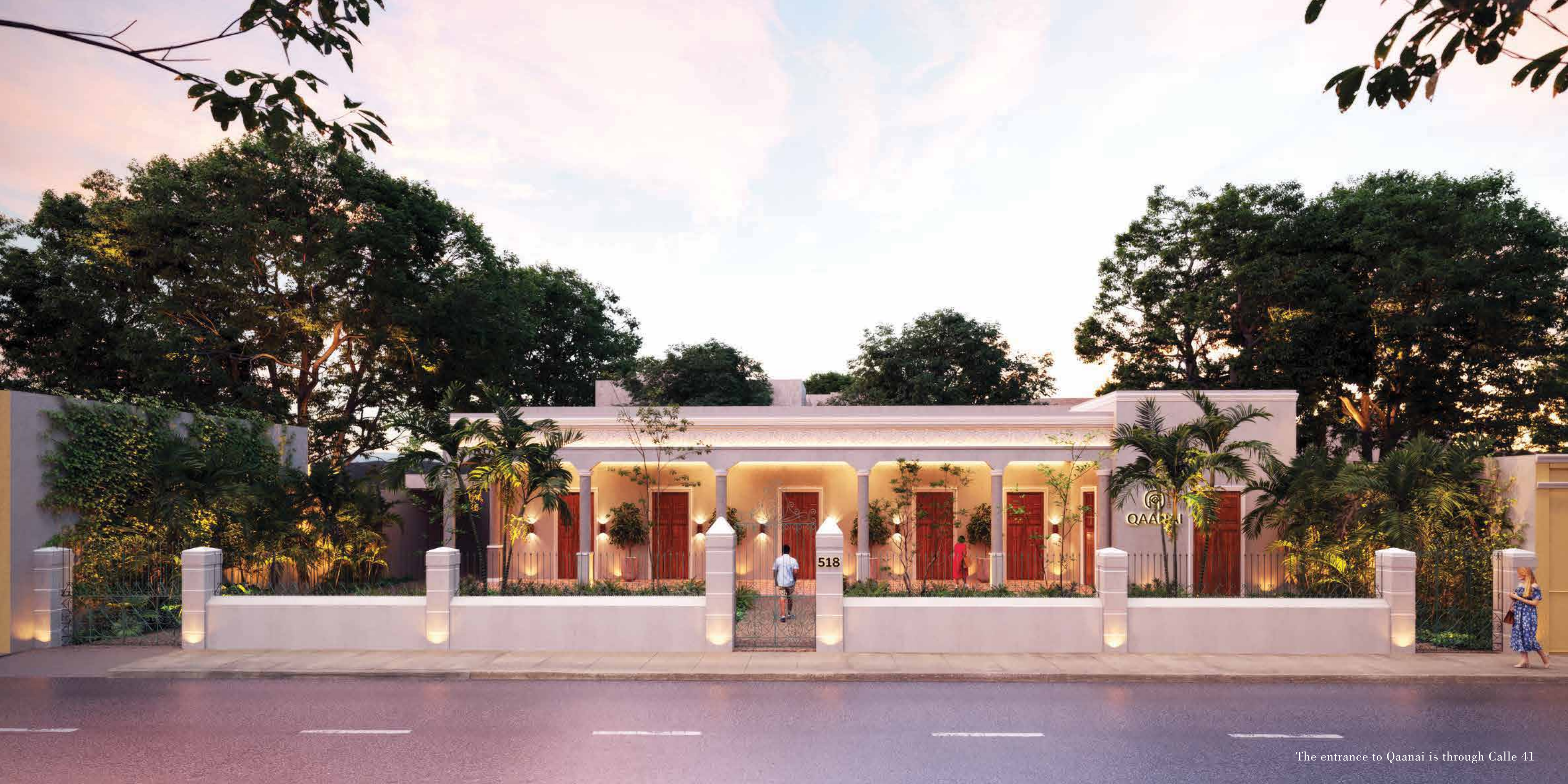
The entrance to Qaanai is through Calle 41