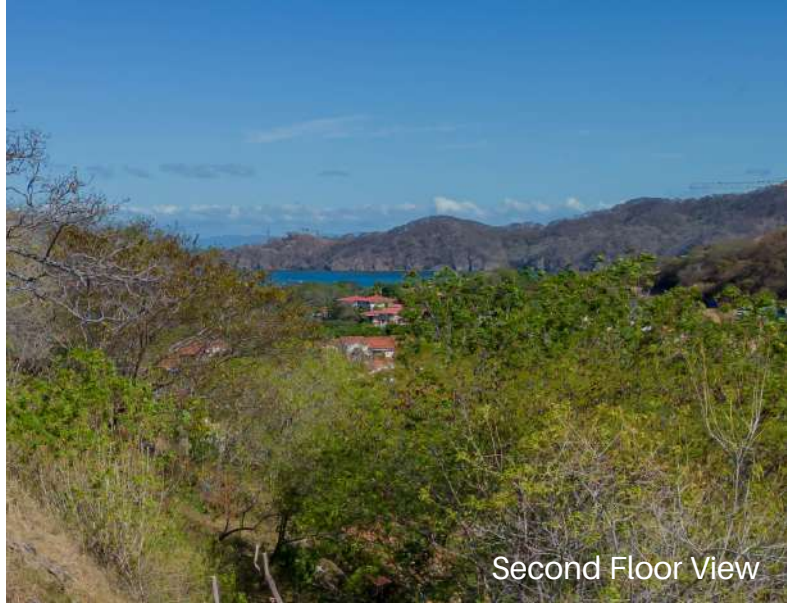
Second Floor View

Isabella community provides underground utilities and fiber optic internet cable. Isabella 9, with 1519m 2 / 0.37 acres and 104 feet of frontage, features a sloping terrain, perfect for building two floors and capturing a partial ocean view from the second floor and even a better view from a roof terrace, along with 180-degree serene mountain views.