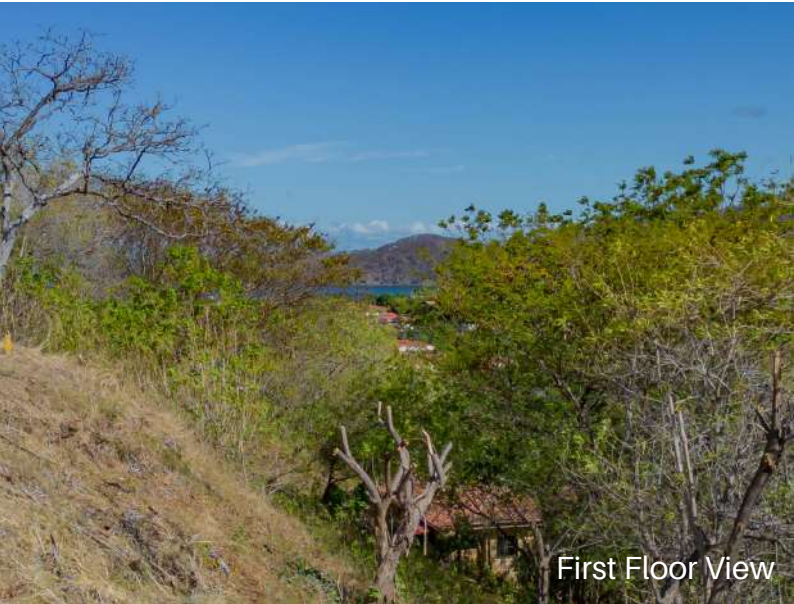
First Floor View