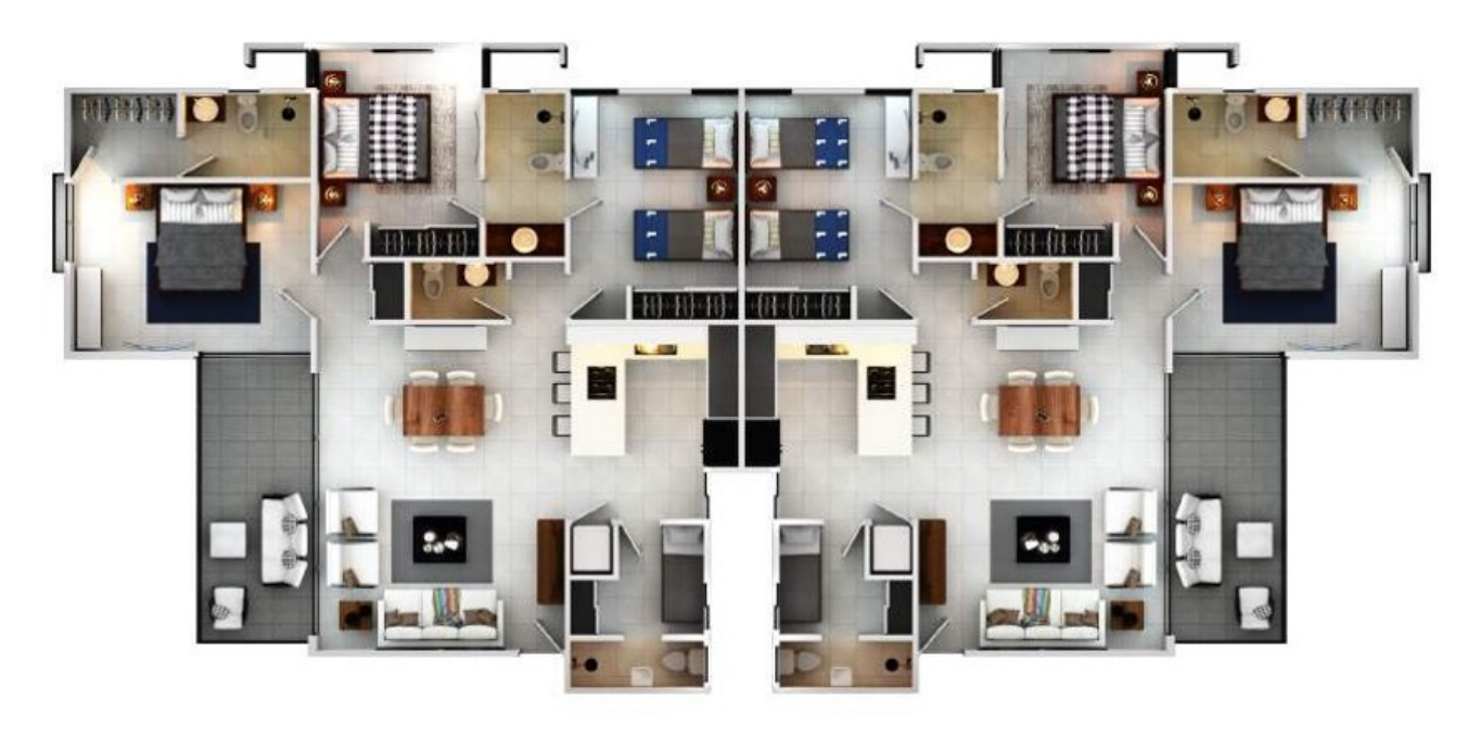
2 bedrooms apartment