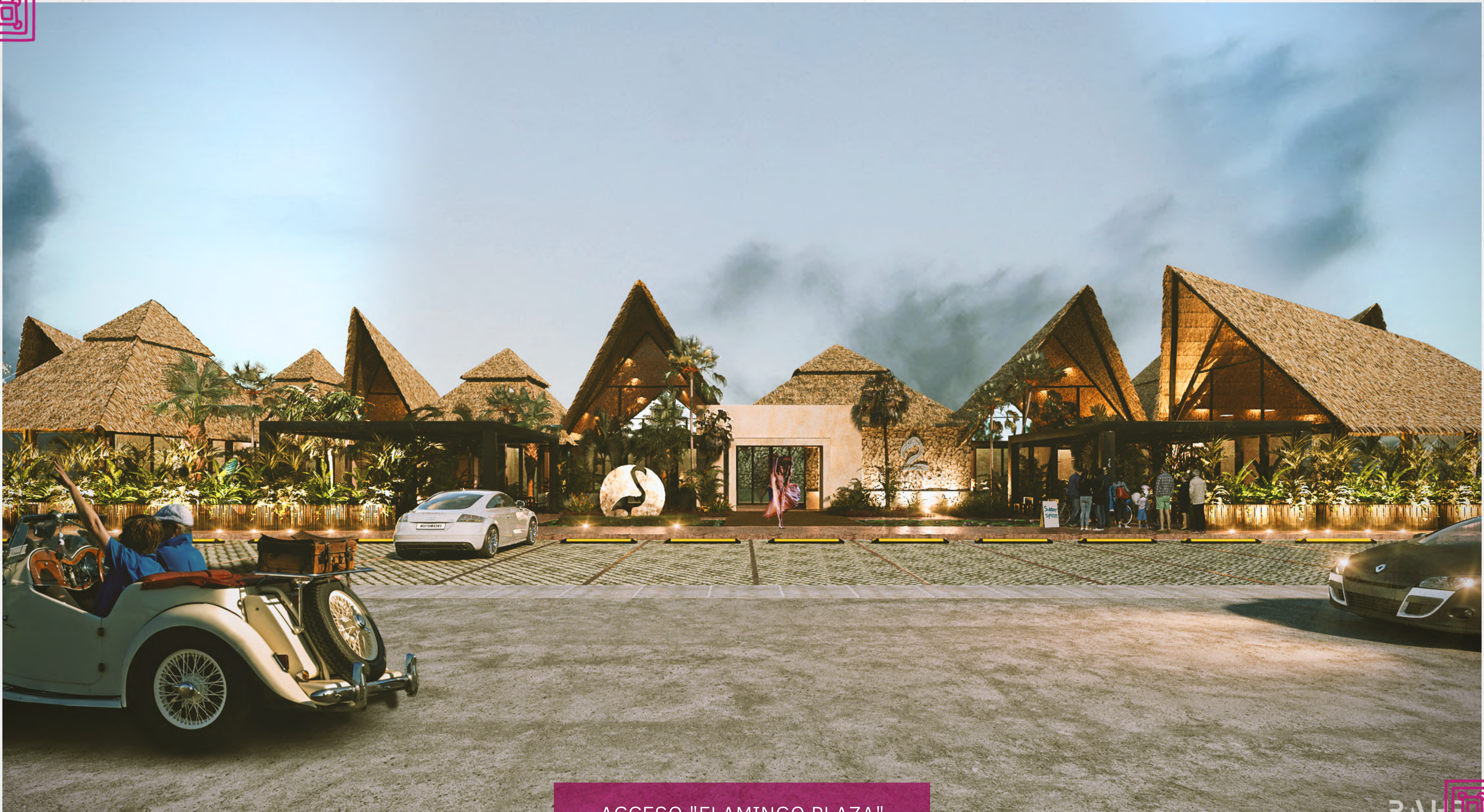
ACCESO "FLAMINGO PLAZA"