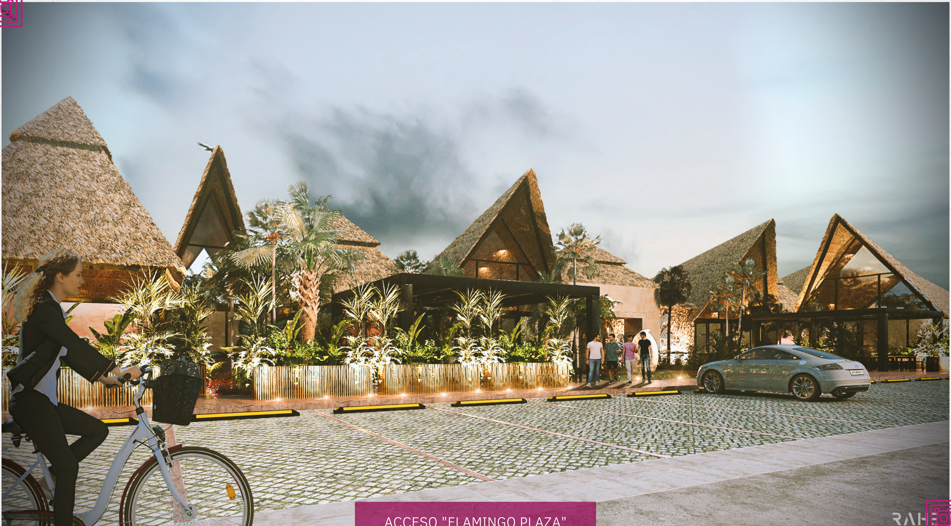
ACCESO "FLAMINGO PLAZA"