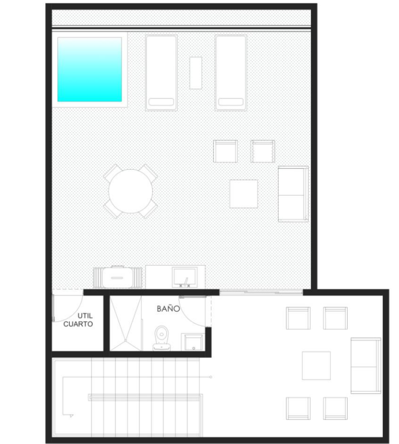
OPCION 1 TERRAZA NAVIO PUERTO SERENO