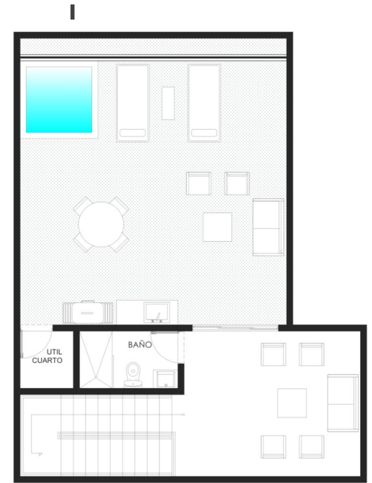
OPCION 1 TERRAZA NAVIO PUERTO SERENO