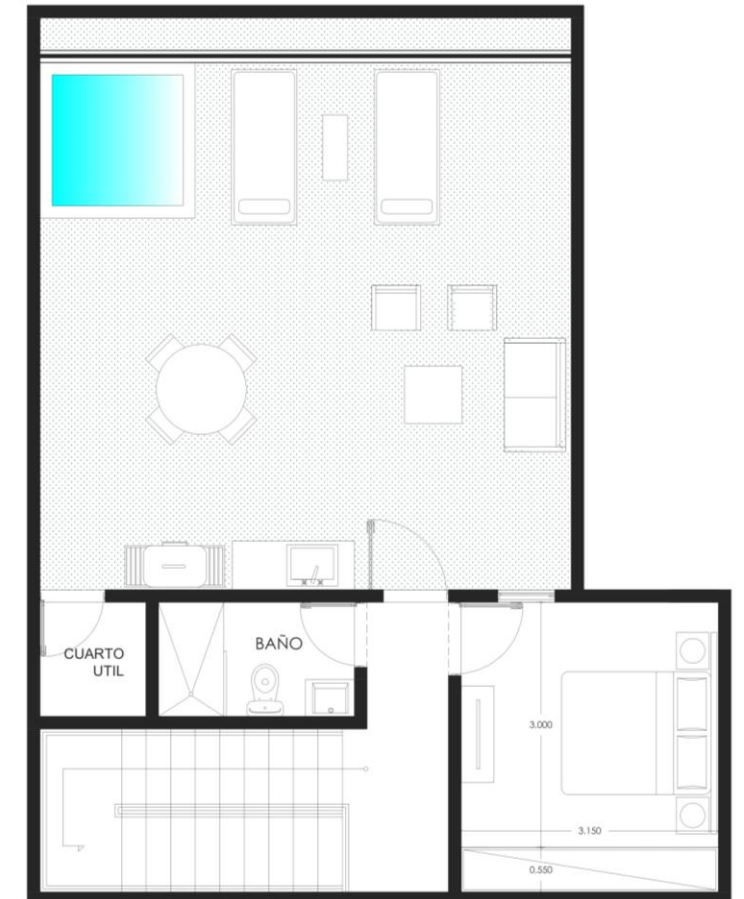
OPCION 2 TERRAZA NAVIO PUERTO SERENO