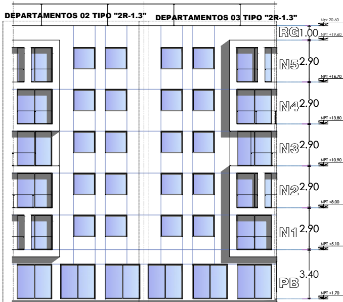
ELEVACION DEPTOS 02 y 03 T-2R-1.3 ESC. 1:25 ACOT. M