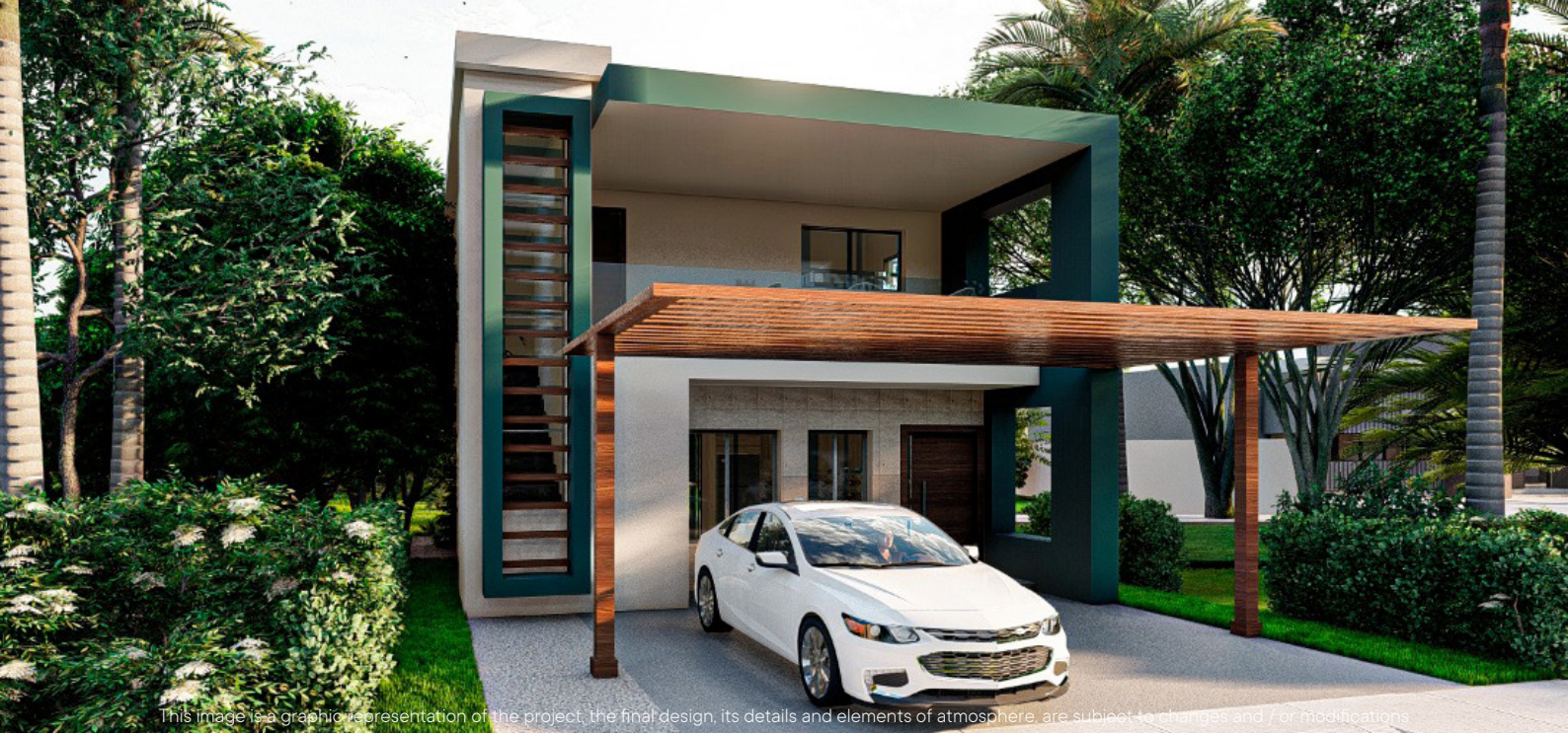
This image is a graphic representation of the project, the final design, its details and elements of atmosphere, are subject to changes and / or modifications