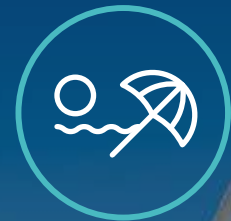
ACCESS TO THE BEACH