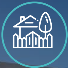
RESIDENTIAL AND RETAIL AREAS

Beach access for residents is provided through both the Club House and numerous walkways meandering throughout the community.