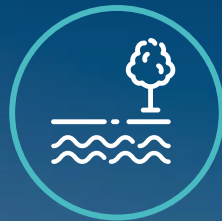
WALKWAY BY THE SEA