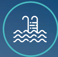
OCEAN VIEW CLUB HOUSE