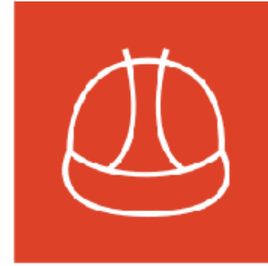
Construction, and Electrical Design