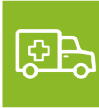
Medical and Dental Services