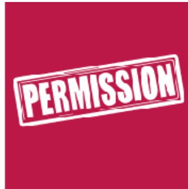
Free Zone Operations Start- Up Permits