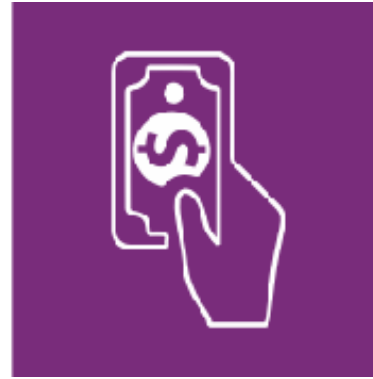
Payroll and Third Party Payments