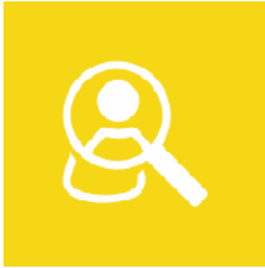
Recruitment and Pre-Screening