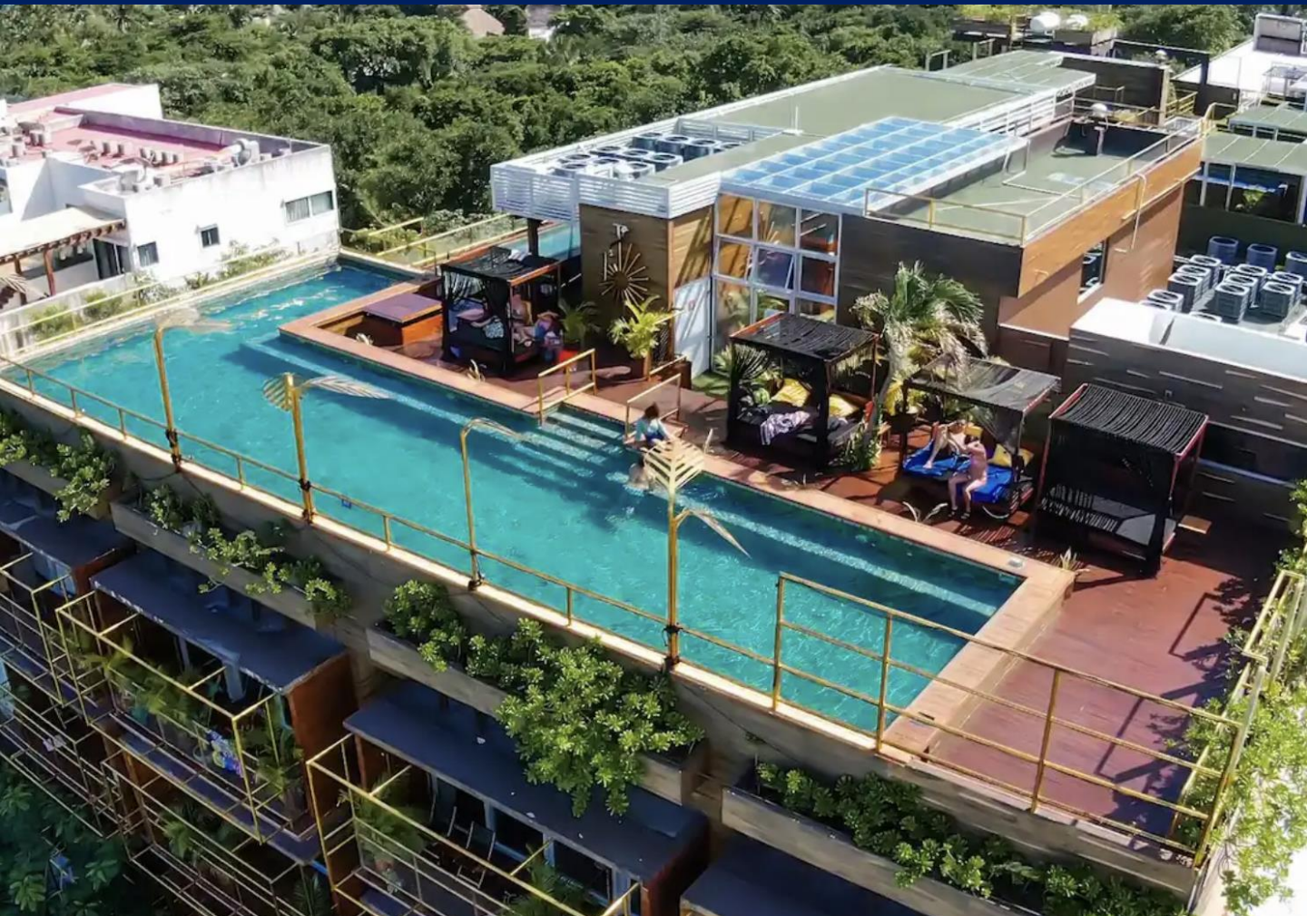
2 Bed 2 Bath Lock Off. Ocean View Rooftop. Art Gallery. Calle 38

RESIDENCIA 2BED I.O. CALLE 38 $389,000 USD Renovated!