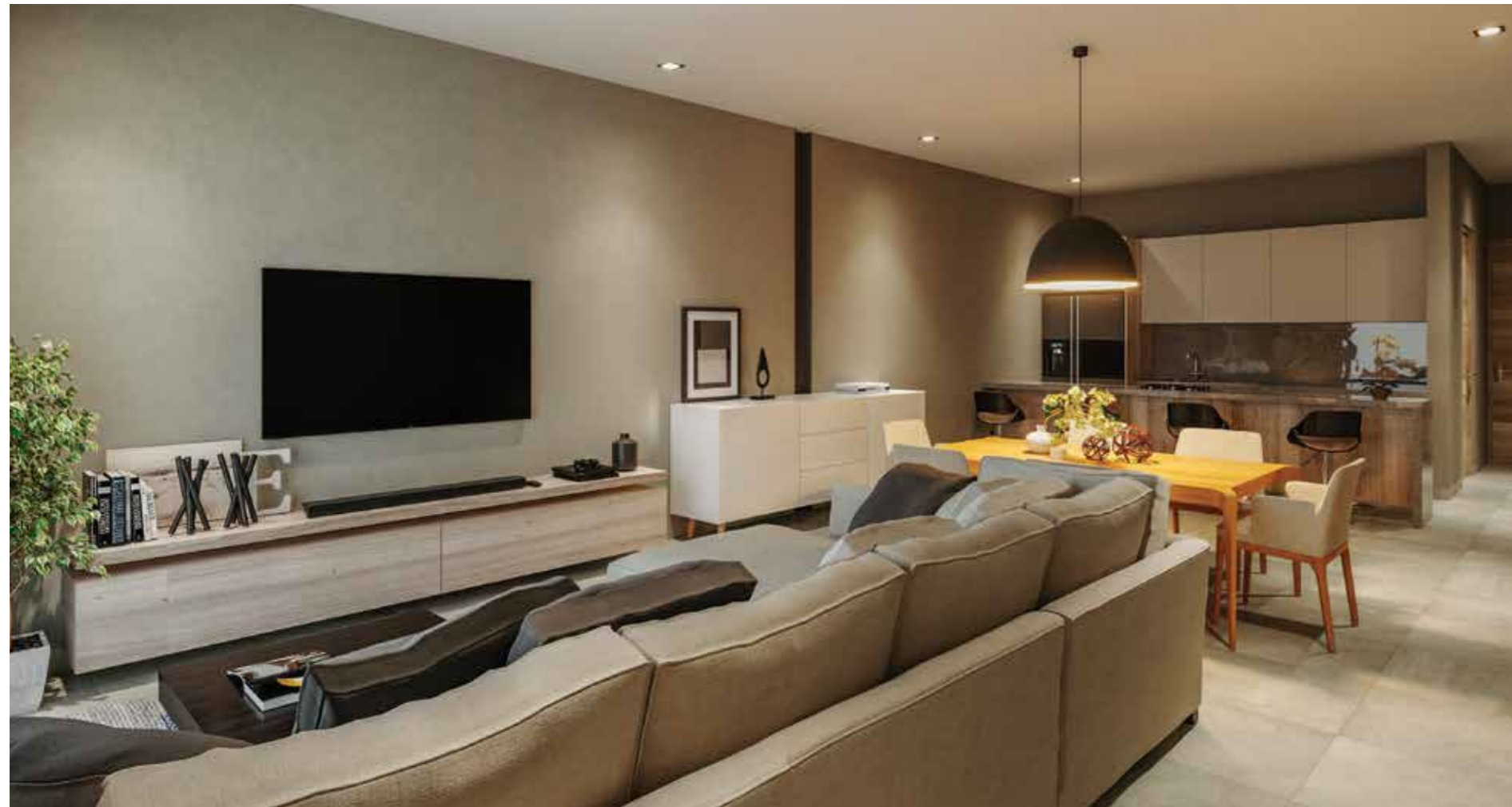
Dining-living room Floorplan 115a