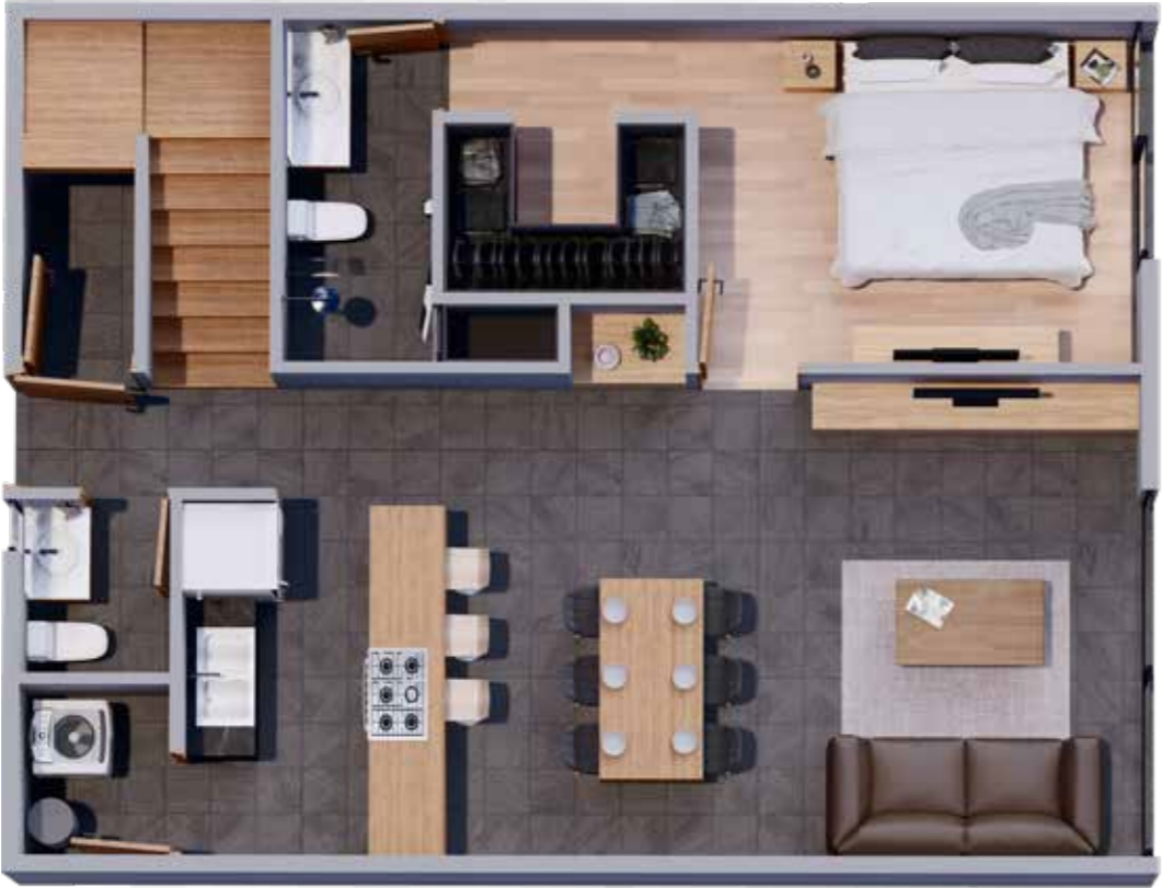
► LOWER FLOOR

The 110 m2 (1184 ft2) type D apartments have one master bedroom with a walk-in closet and a full bathroom, a half bathroom, kitchen, double-height living and dining room, and laundry room on the lower floor.