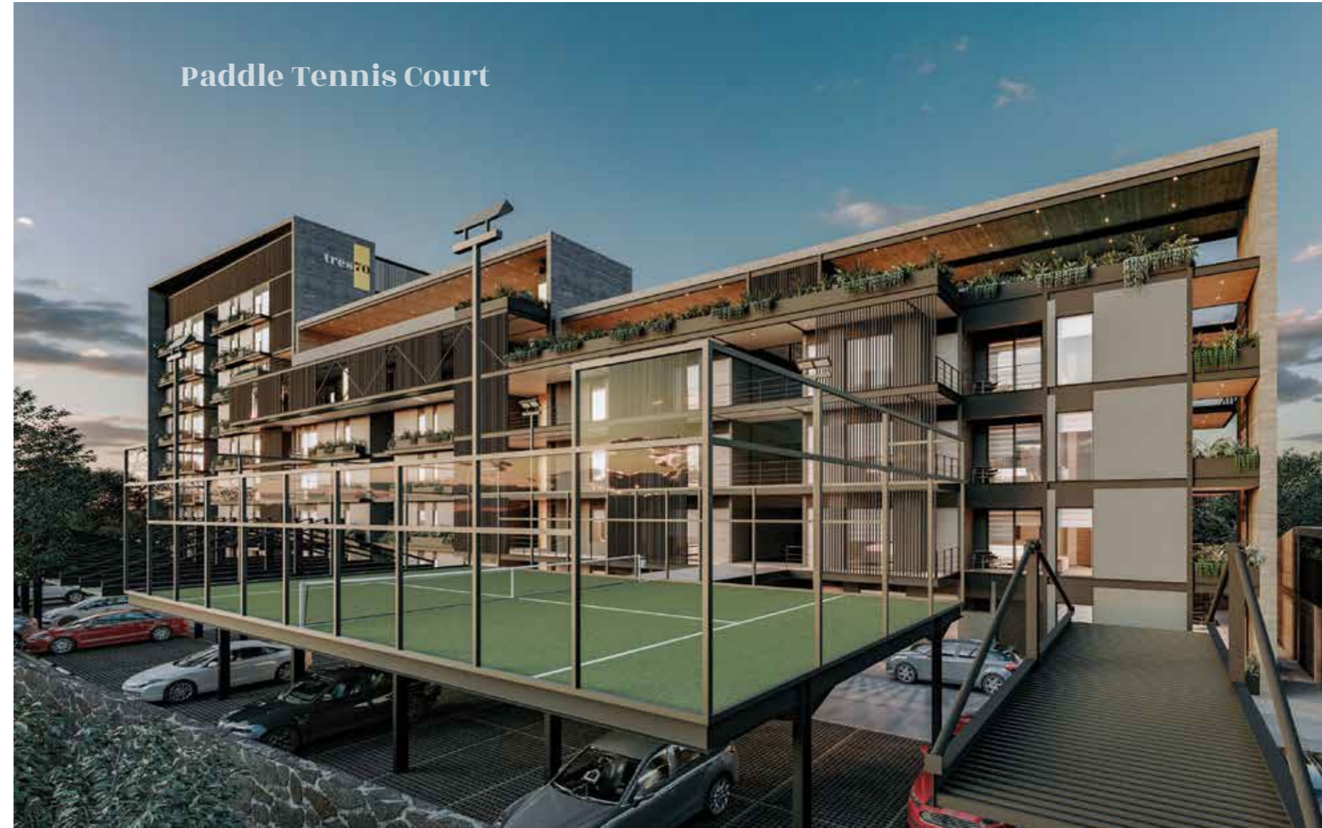
Paddle Tennis Court