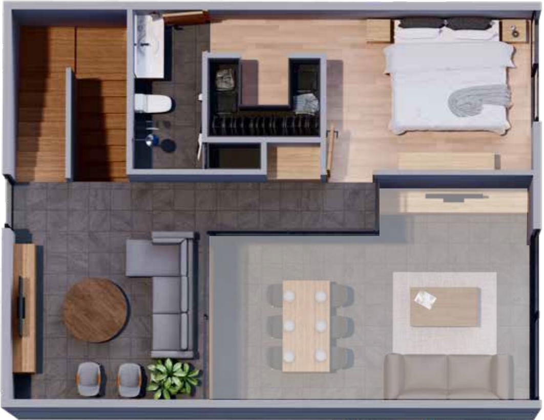
► UPPER FLOOR

Image shown for illustrative purposes only.