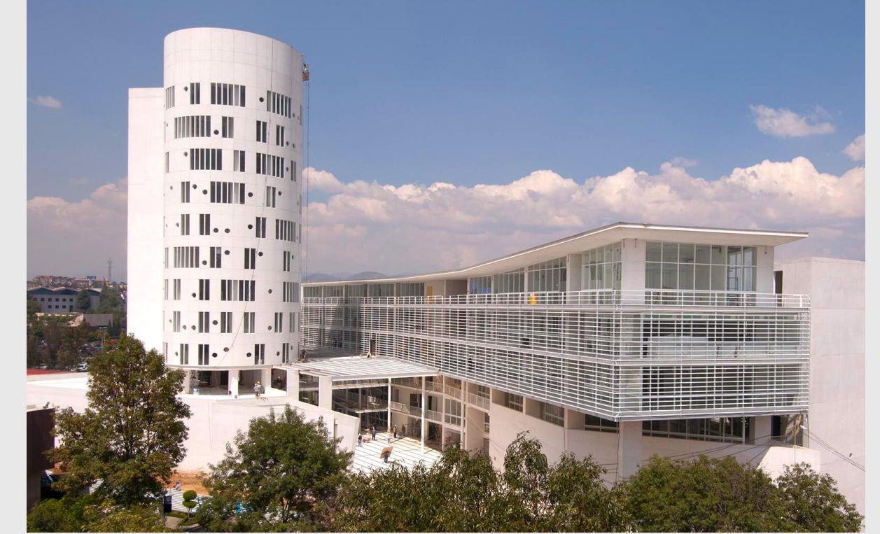
CEDETEC LAGO GUADALUPE – EDO. DE MÉXICO