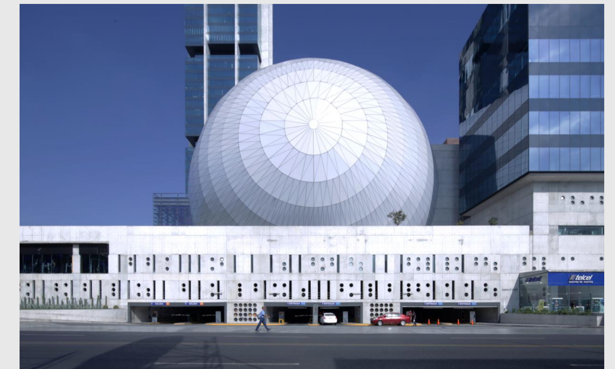
PABELLÓN M – MONTERREY, N.L.