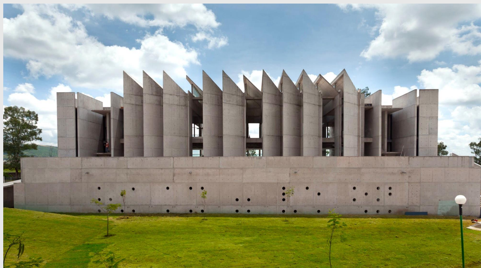
UIAC LEÓN – LEÓN, GUANAJUATO