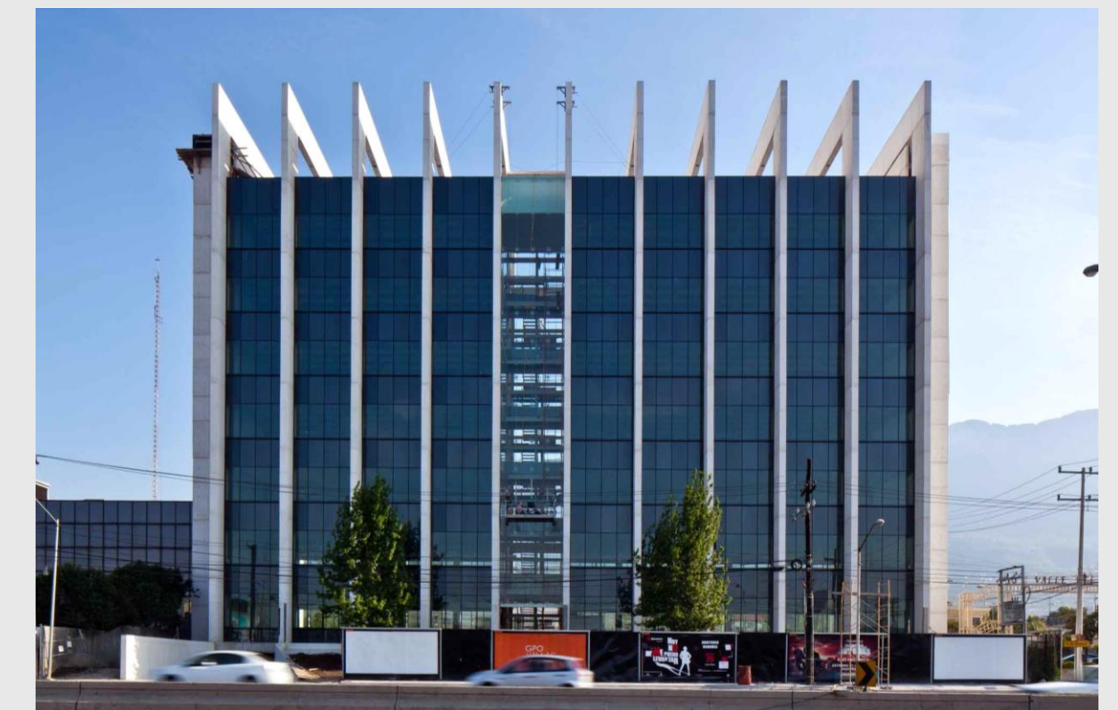
TORRE VASCONCELOS – SAN PEDRO G.G., N.L.