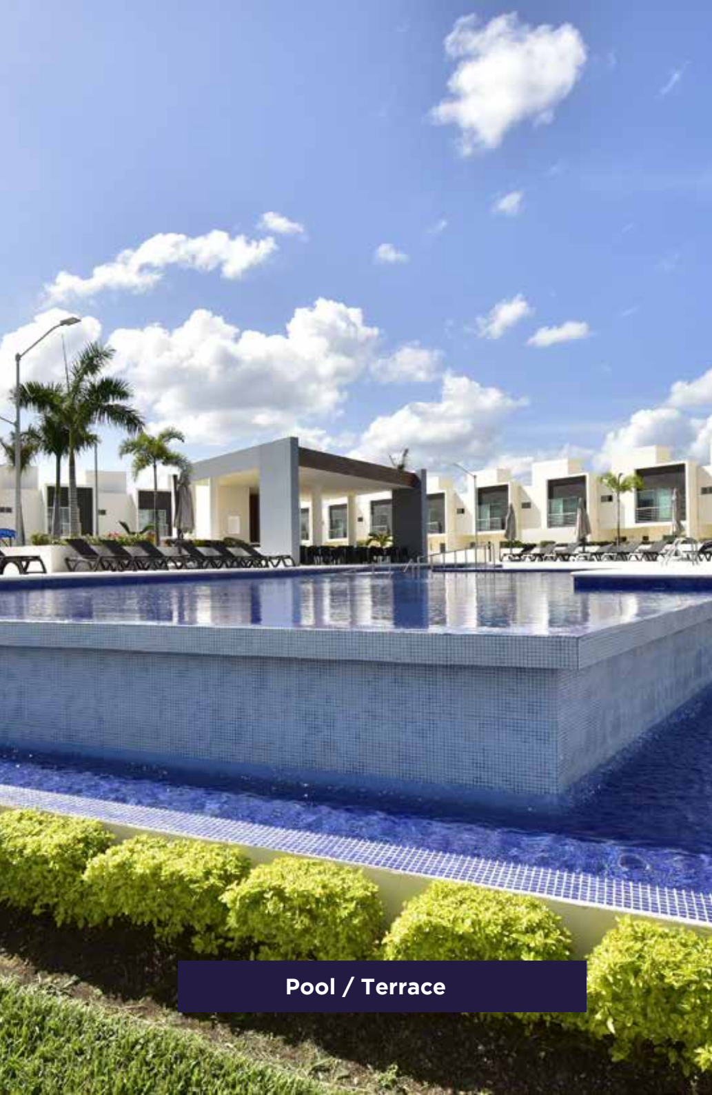
Pool / Terrace