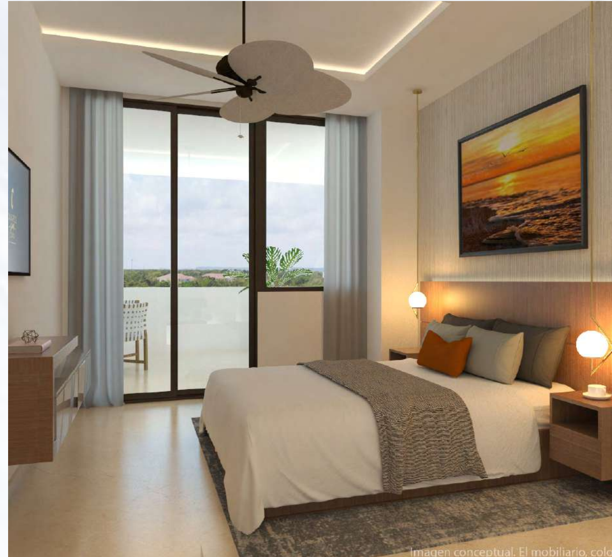
Imagen conceptual. El mobiliario, color

*Refrigerator, stove, washer, dryer and air conditioning units